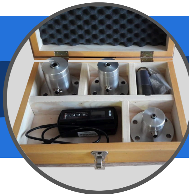
ST Series Transducer